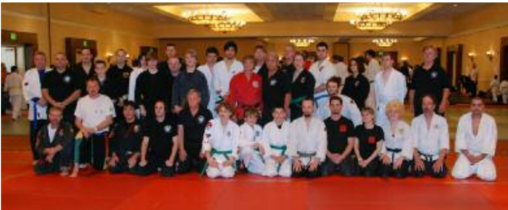
Participants from one of the MANY classes at the Kufferath Symposium